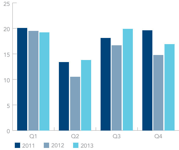
OILFIELD GROSS PROFIT ($ MILLIONS)